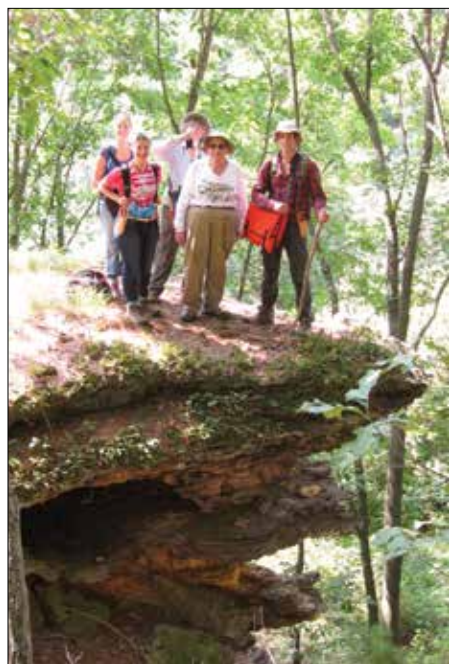
Rock outcrop at Ridgeway Pine Relict SNA