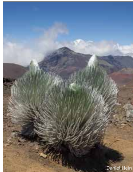
Silverswords in Haleakalā crater

from attack by introduced ants, the Maui silversword now appears to be doomed ... by us. Due to global warming, populations at the lower edge of the silversword's elevational range have been shrinking for more than a decade, and further warming may reduce rainfall