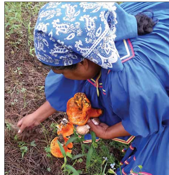
A Rarámuri collaborator in western Mexico collecting sokowekeri ( Russula brevipes mushrooms parasitized by Hypomyces lactifluorum fungus) to eat

Traditional crop varieties are disappearing in many parts of the world due to changing livelihoods and access to hybrid seed, but having diverse, locally adapted heirloom crops provides a form of insurance against pests and extreme weather. The seedbanking facilities in the structure will provide an ex situ repository for maize, beans, squash, peppers, tomatillos, and other crops that are central to traditional foodways and cosmology.